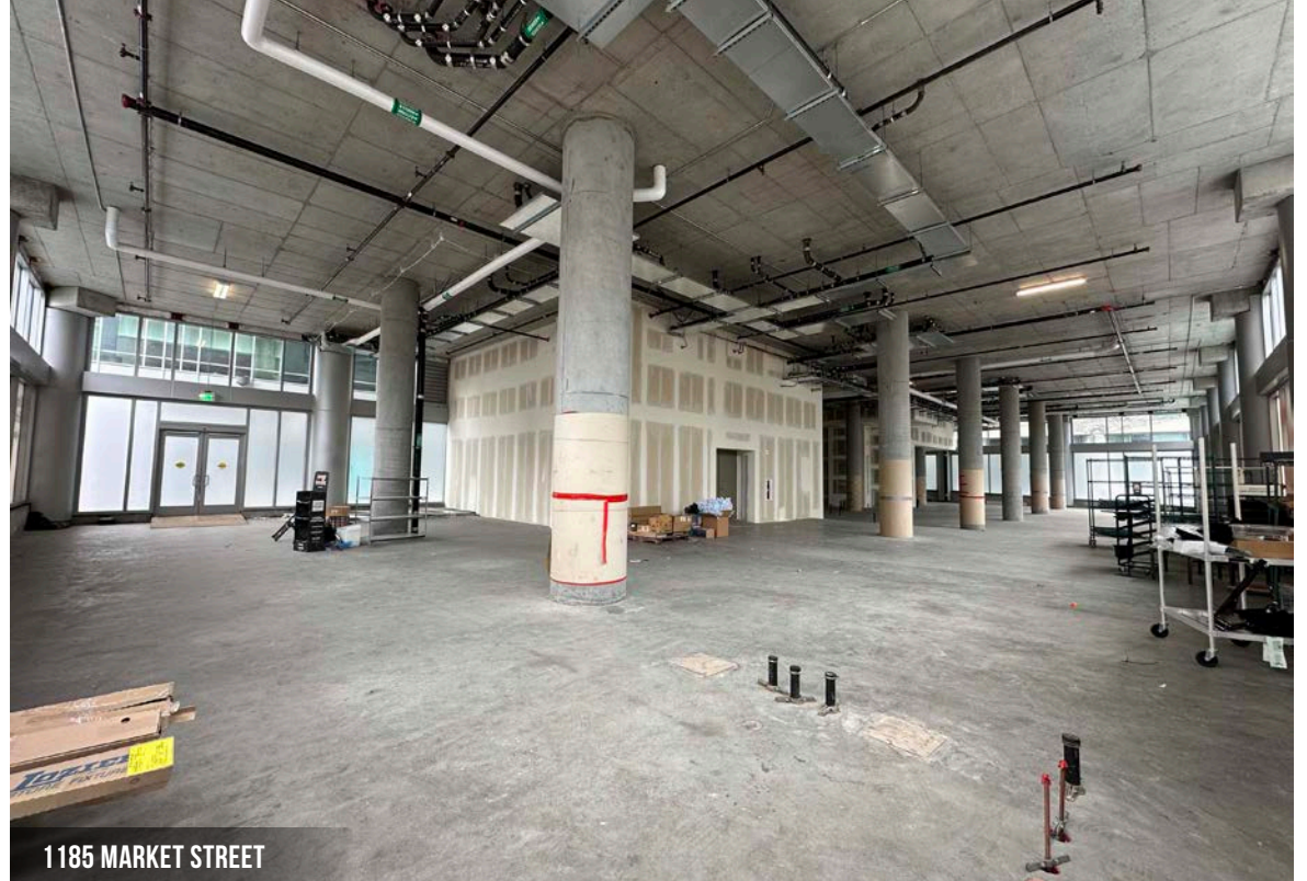
1185 MARKET STREET