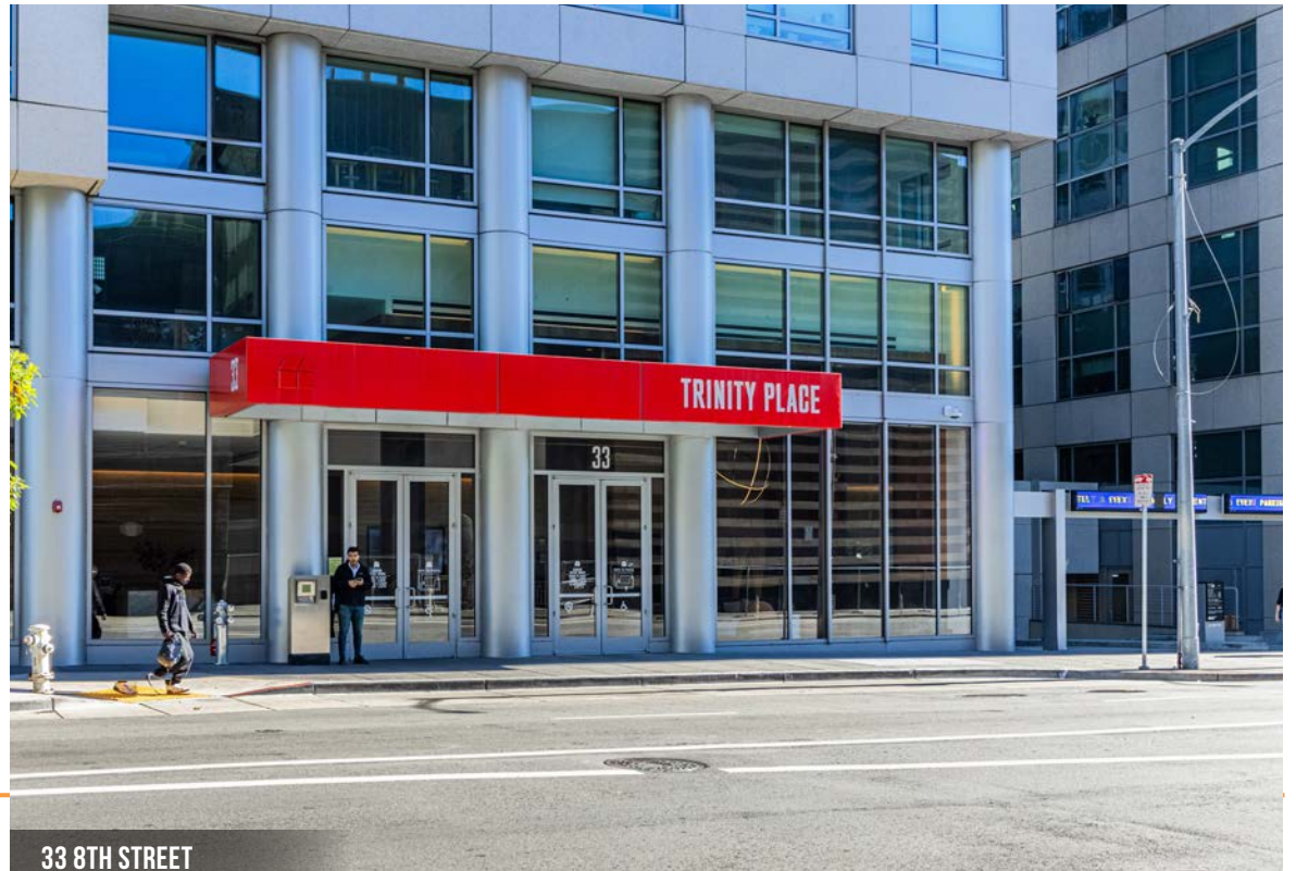
33 8TH STREET