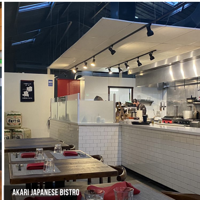
AKARI JAPANESE BISTRO