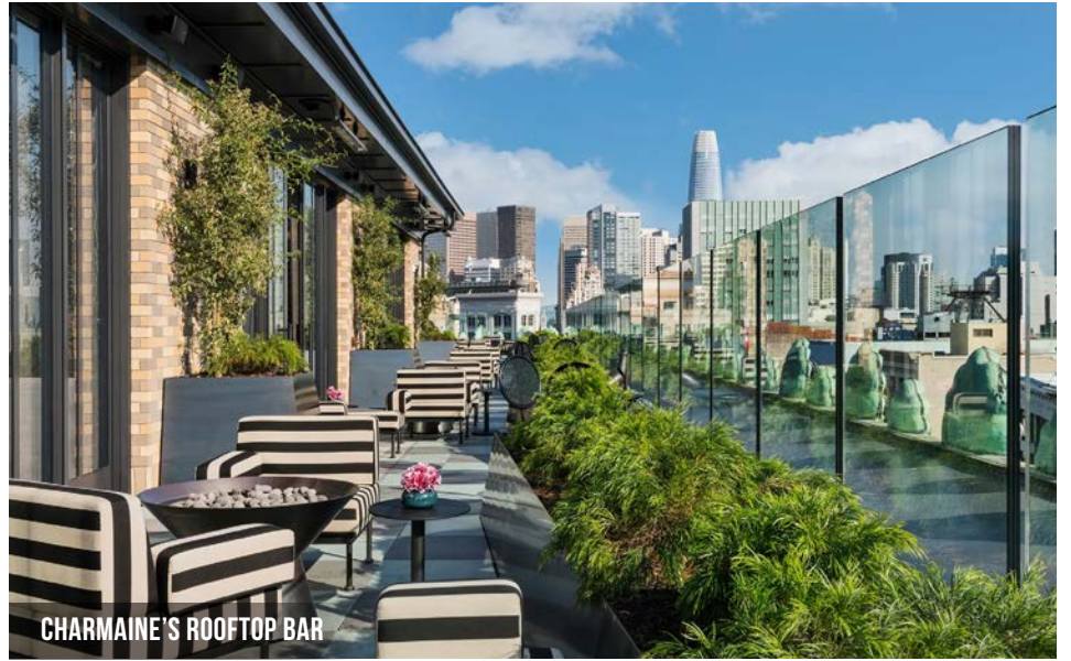
CHARMAINE'S ROOFTOP BAR