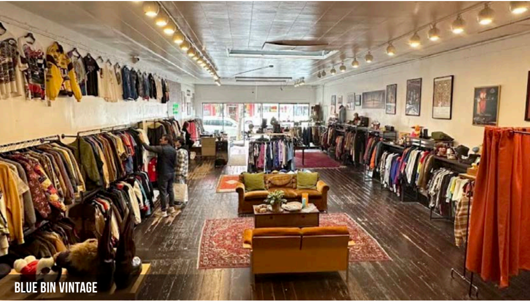
BLUE BIN VINTAGE