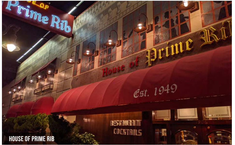
HOUSE OF PRIME RIB