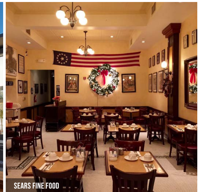
SEARS FINE FOOD