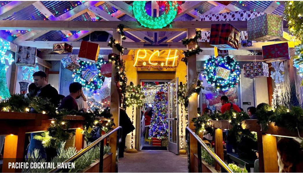
PACIFIC COCKTAIL HAVEN