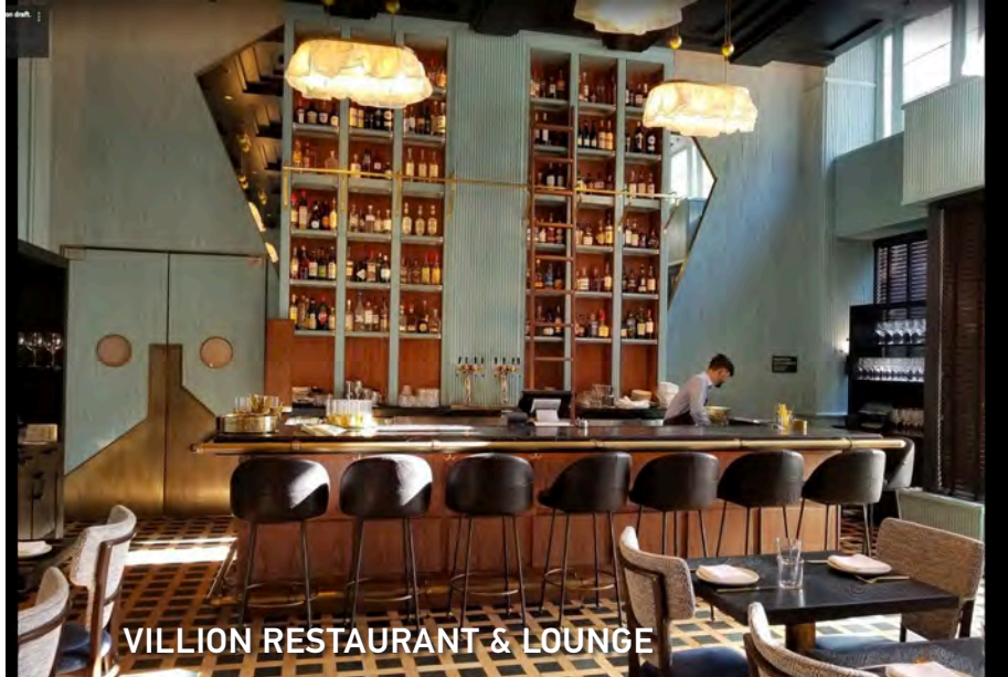
VILLION RESTAURANT & LOUNGE