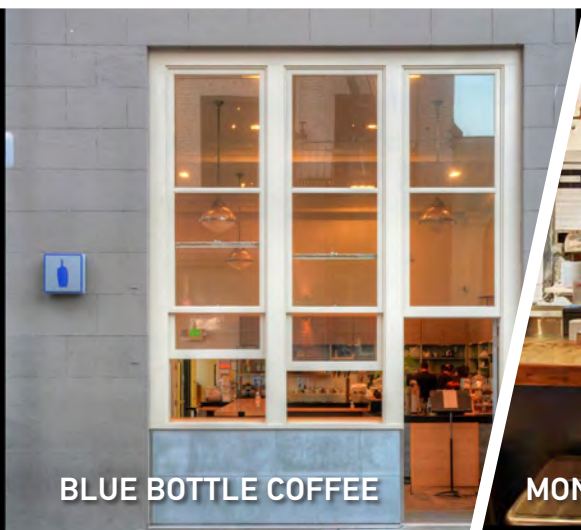
BLUE BOTTLE COFFEE