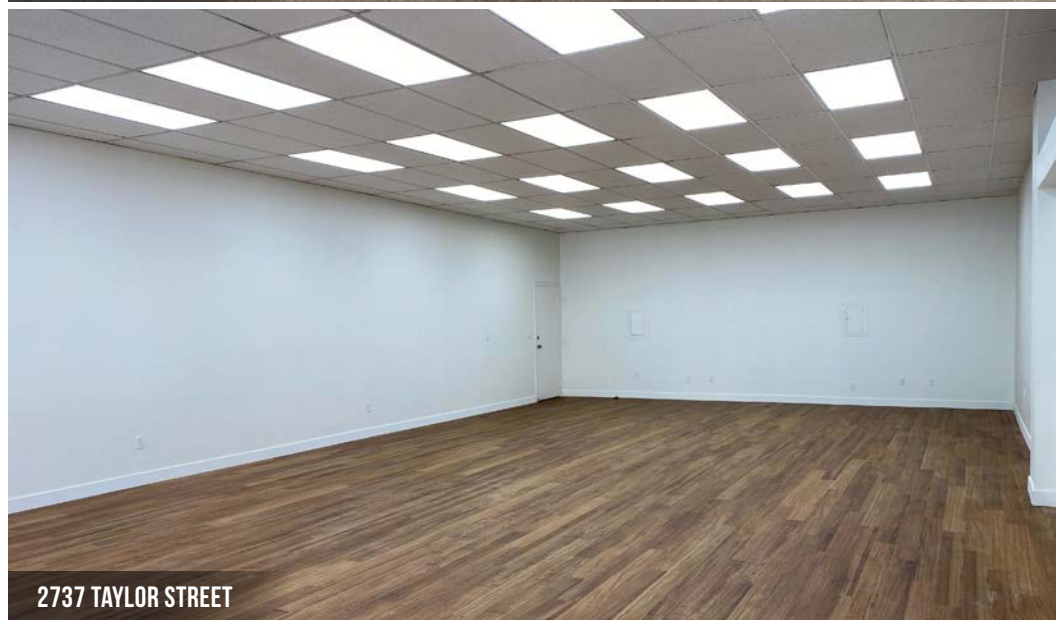
2737 TAYLOR STREET