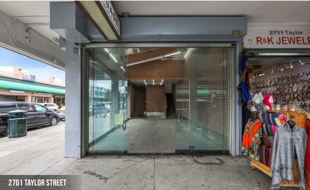
2701 TAYLOR STREET