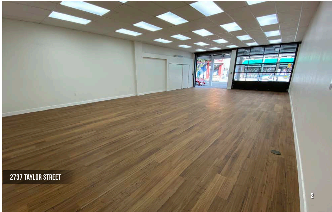
2737 TAYLOR STREET