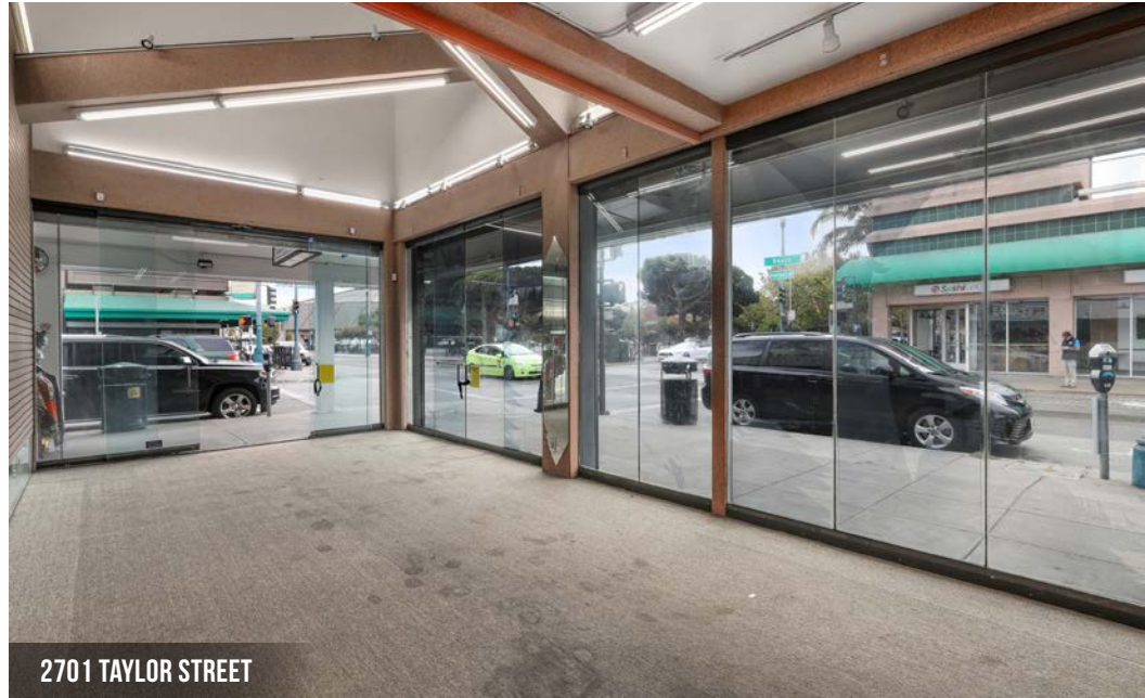
2701 TAYLOR STREET