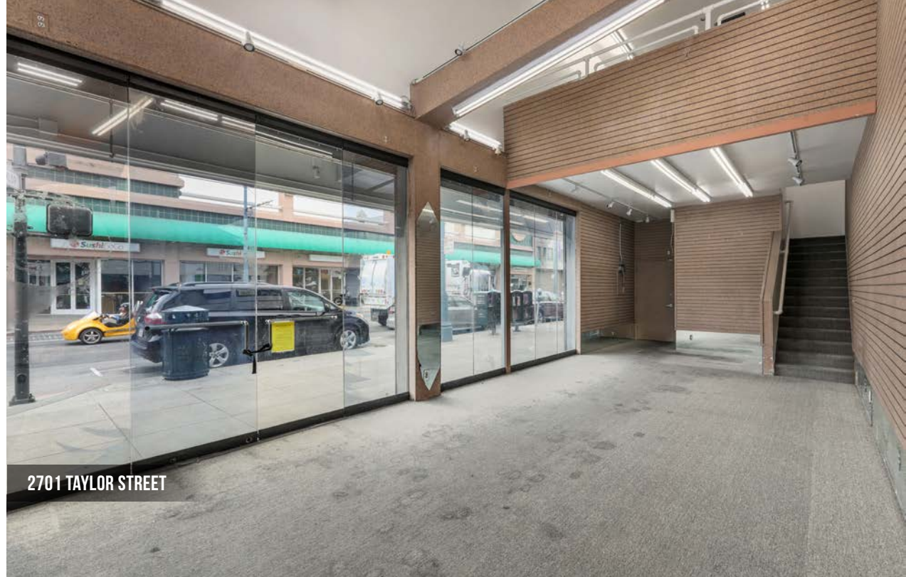
2701 TAYLOR STREET