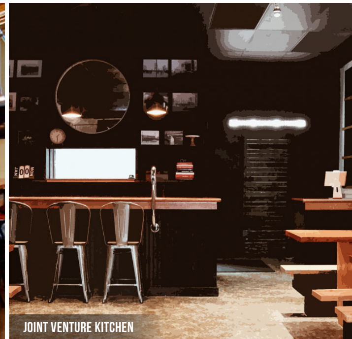
JOINT VENTURE KITCHEN