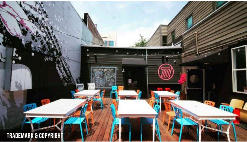
TRADEMARK & COPYRIGHT