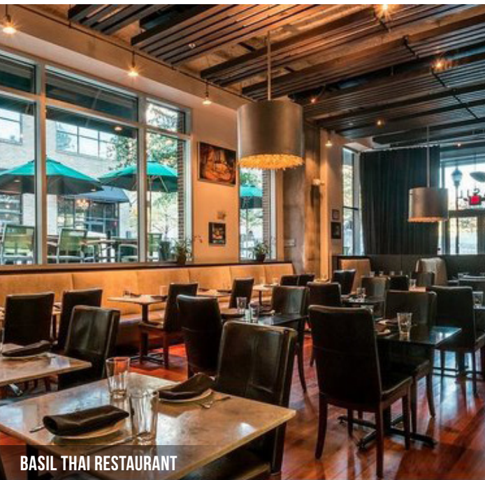
BASIL THAI RESTAURANT